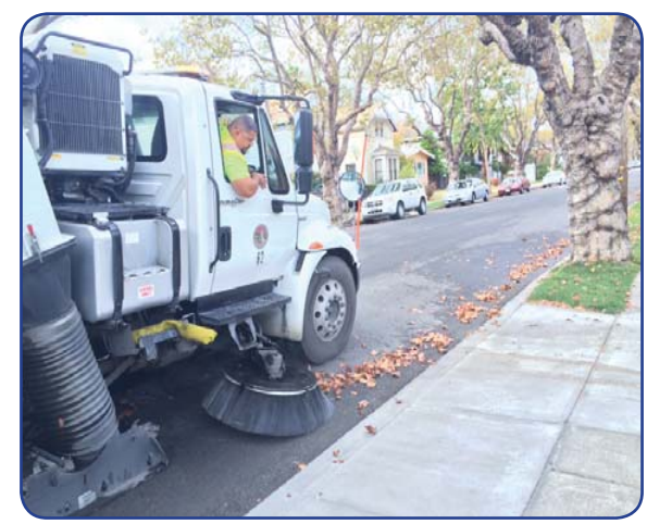
The City's Clean Water Program removes 823 dump truck loads of debris, including debris from the City's streets by sweeping 24,000 miles annually.

If you lose your ballot, require a replacement ballot, or want to change your vote, contact Sarah Henry at (510) 747-4714 or by email at shenry@alamedaca.gov for another ballot. See the enclosed ballot for additional instructions.