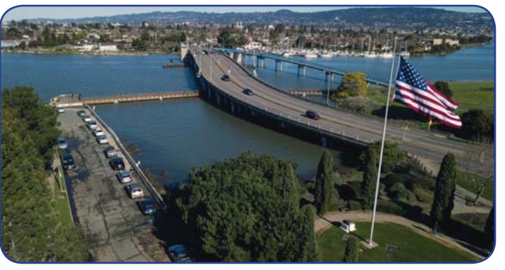
The City of Alameda's Clean Water Program maintains the storm drainage infrastructure which protects homes, property, and streets from flooding and protects the City's beaches and the Bay from trash and pollutants caused by urban runoff during rain events.

All Ballots Must Be Received By 6:00 pm November 25, 2019 To Be Counted