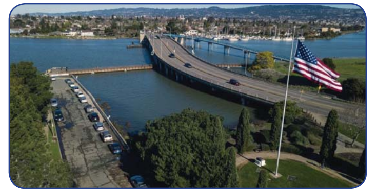
The City of Alameda’s Clean Water Program maintains the storm drainage infrastructure which protects homes, property, and streets from flooding and protects the City’s beaches and the Bay from trash and pollutants caused by urban runoff during rain events.

To continue to maintain our storm drainage infrastructure and avoid eliminations and/or significant cuts to existing programs, the Clean Water Program is proposing The 2019 Water Quality and Protection Initiative . This additional storm drainage fee is dedicated to our storm drainage system and funds cannot be used for any other purposes.