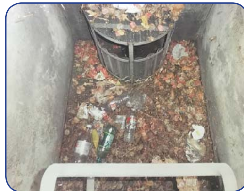
The City cleans and inspects 250 trash capture devices quarterly, removing 40 cubic yards of debris annually.

The proposed 2019 Water Quality and Flood Protection Fee revenues will be collected and deposited into a separate account that can only be used for authorized storm drainage activities and will undergo annual independent audits. The City Council must approve the fee each year in a public meeting, and the fee can never exceed actual estimated costs.