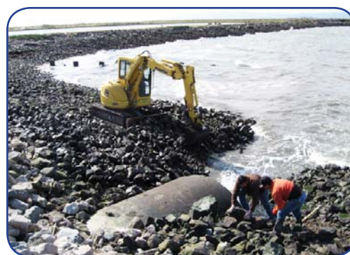
The City has conducted a series of engineering studies to determine the best ways to protect neighborhoods during big storms and sea level rise.

Each parcel with a proposed fee greater than zero will count for a vote. Ballots will be tabulated under the direction of the City Clerk at a location accessible to the public. The tabulation will commence at 9:00 am on Tuesday, November 26, 2019, in City Hall at 2263 Santa Clara Avenue Room 380 and continue between the hours of 9:00 am and 4:00 p.m. until the tabulation is complete.